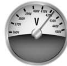
Wide voltage range

The ducted systems can function across a wide voltage range of 360 - 440 V, making them a rare breed.